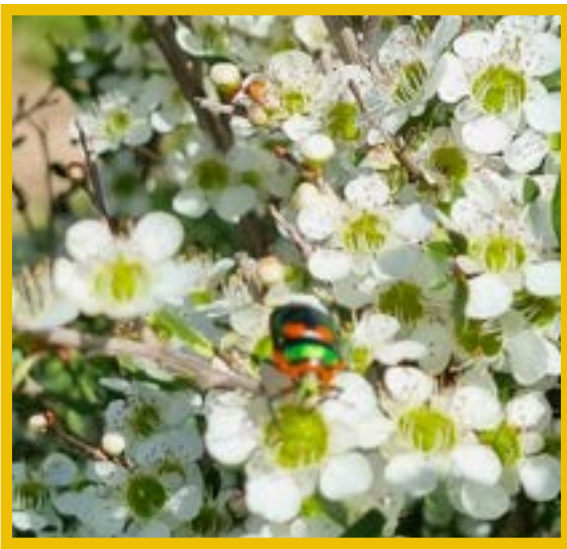
Jewel Beetle Buprestidae