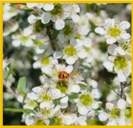
Lady Beetle (Coccidulini)