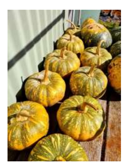
Bumper crop of pumpkins

If you have harvested any excess vegetable or flower seeds over the last couple of months please drop them in for inclusion in our seed library. Stock is low in some varieties (e.g. beans) and we rely on experienced vegetable growers in the community for your seed contributions.