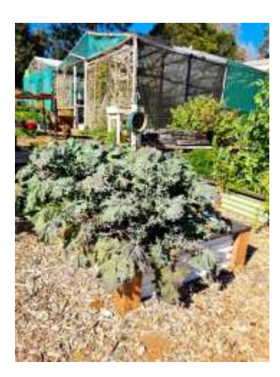
Greenhouse ripe for renovation